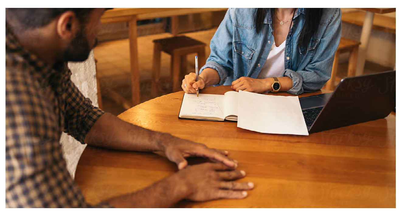
ICC | A Two-Way Street: The Role of Employers in Immigrant Labour Market Integration in Canada

The findings and recommendations within this report will help employers more effectively leverage newcomer talent while also addressing some of the pernicious barriers preventing their labour market integration. While the evidence from the GTA is compelling and the insights are instructive, we recommend that additional research be conducted into the behaviours, practices and challenges of employers across Canada. The research should aim to identify specific interventions that can address employer concerns or hesitations about hiring immigrant job seekers. A national scope is required to capture nuances across sectors, industries, company scales and jurisdictions.